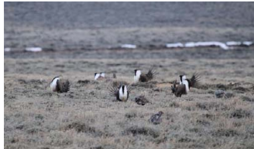
Greater sage grouse viewing in Walden, Spring 2011.

For more information about our other wildlife festivals, go to www.wildlife.state.co.us/viewing .