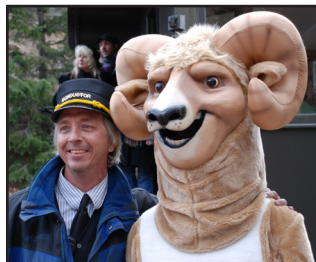
Meet Elbert the Bighorn!

Kids under 12 are invited to Hamill House to bounce away part of the day!