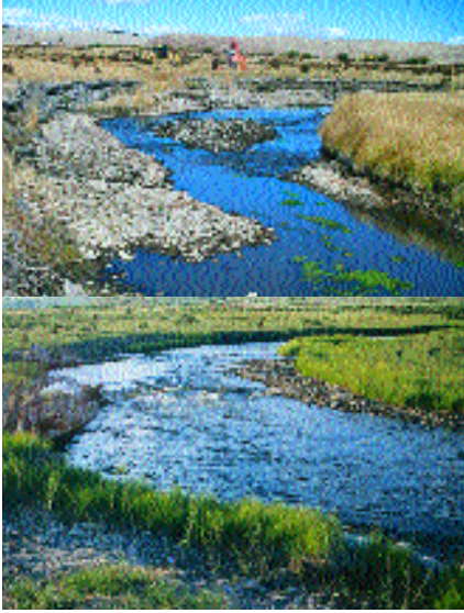
Sweatwater Creek, which adjoins the Knight-Imler State Wildlife Area, before (top) and after excavated pool improvements.

from the Threemile Creek watershed had deposited huge sediment loads in more than a mile of the Dream Stream. A new high-flow channel was constructed to direct Threemile Creek floodwaters into an abandoned borrow pit created during the construction of Spinney Dam. A 500-foot low-level dam constructed on the Lower Spinney State Wildlife Area and located between two low ridges increased the capacity of the borrow area. A pipe gate slowly releases impounded floodwaters, after losing its silt load in the borrow area, onto a riparian vegetation buffer strip ensuring waters entering the Dream Stream contain little if any silt.