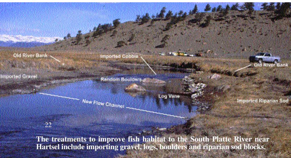
The treatments to improve fish habitat to the South Platte River near Hartsel include importing gravel, logs, boulders and riparian sod blocks.