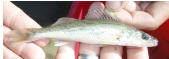
Young of the year sauger

The reservoir has been managed as a coolwater assembly since DOW took over management. Primary game species have been: Walleye, Wiper (Hybrid - White Bass x Striped Bass), Channel Catfish, Smallmouth Bass, and Rainbow Trout. Other species have established self sustaining populations: Bluegill, Black Crappie, Largemouth Bass and Yellow Perch.