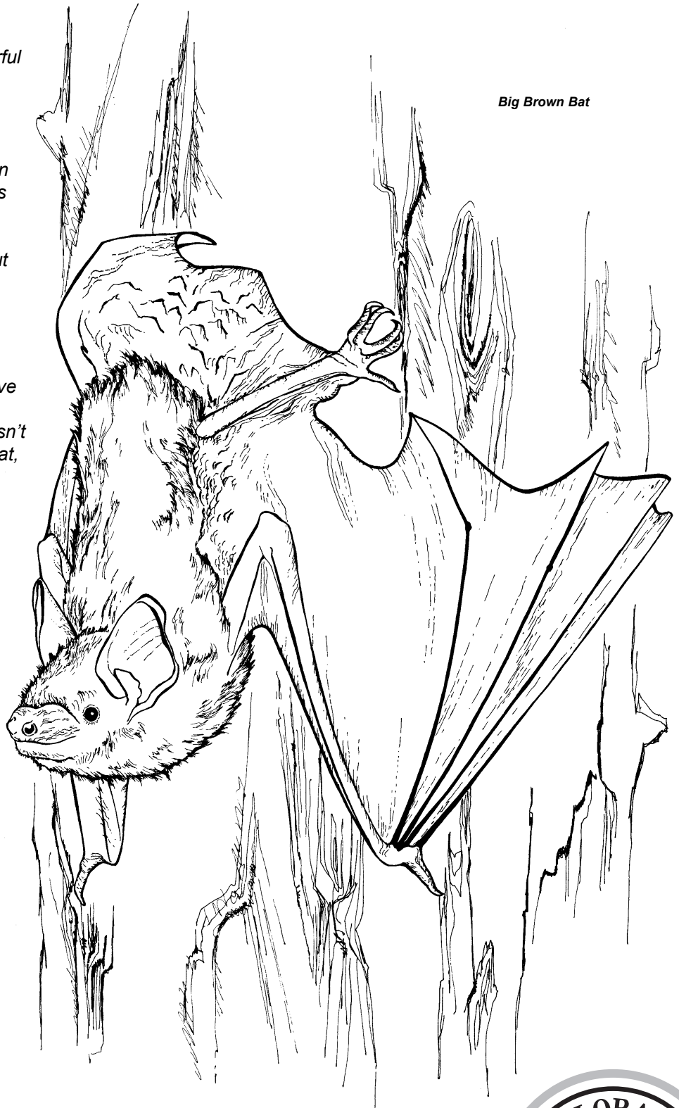
Big Brown Bat

Most bats roost by hanging from their toenails. Bats' knees face backward so that their toes can grip the tree or cliff that they rest on. The tendons in bats' feet are designed to tighten the grip of their toes and lock them into place when the bats' entire weight is suspended from them. Once they are "locked-in," bats may fall asleep without danger of falling.